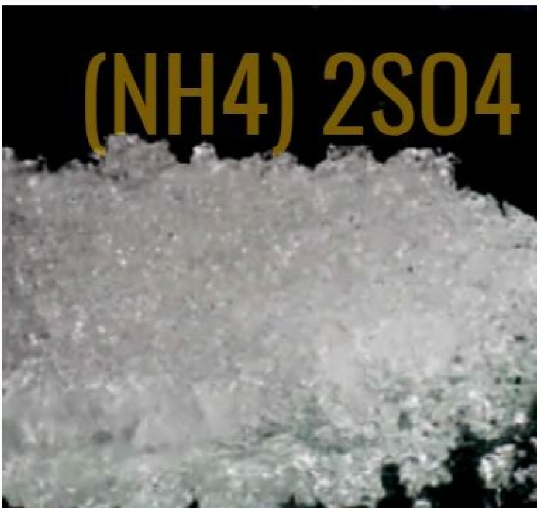
Fire warden 50x data sheet.